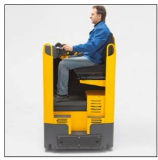
Comfortable seated position with generous