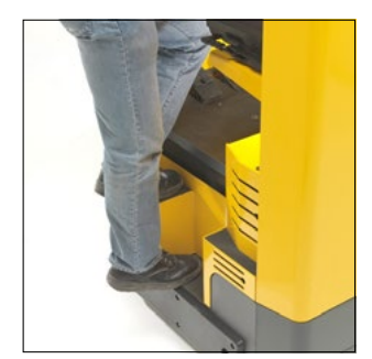
Safe entry with low step height and grab handle