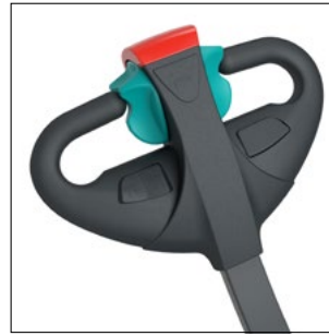
Ergonomic designed tiller head