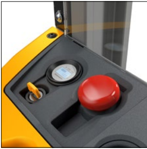
Centralized control instruments