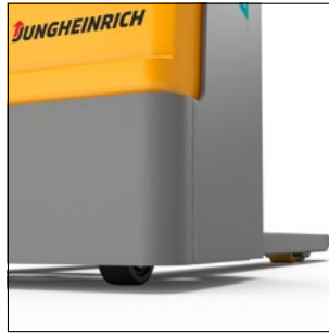
High level of safety due to low ground clearance