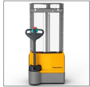
Optimized visibility through mast