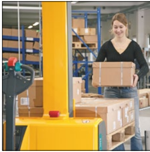
Use as lifting table for loading with ease