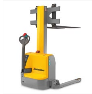
EMC B10 with FEM / ISO fork carriage (optional)