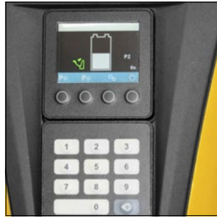
New 2" enlarged truck display