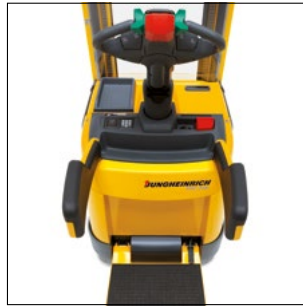
ERC operator position