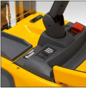
ERC storage compartment