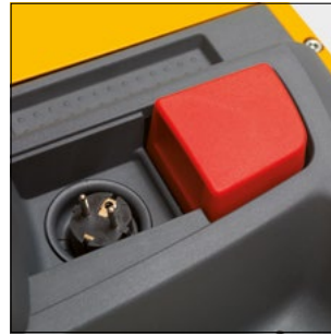
Easy to operate mains connector for on-board charger