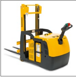
Ergonomic operating handle