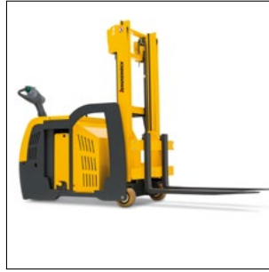
Increased ground clearance with large load wheels.