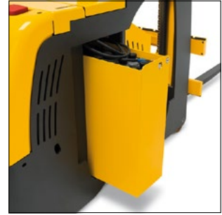
Lateral battery exchange (optional)