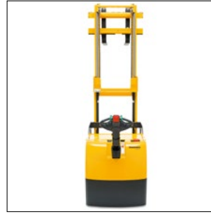
Excellent view of the load for precise positioning