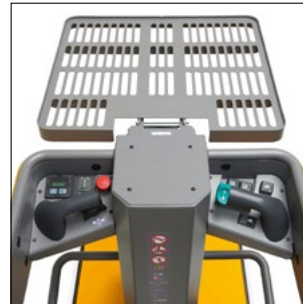
Controls and storage tray in view at all times