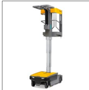
Safe even at full height