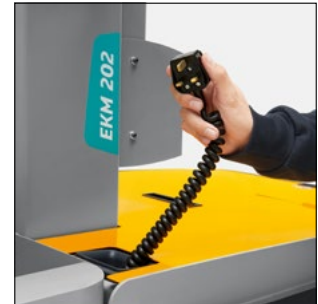
On-board charger with integrated spiral cable for standard Plugs ,