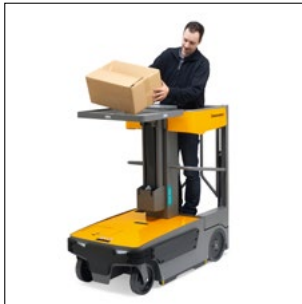
Generously designed storage tray