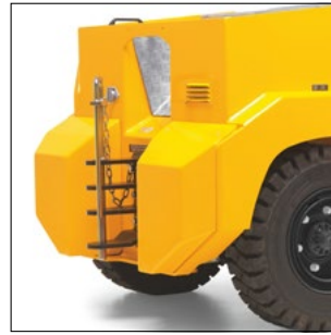
Multi-stage coupling for different trailer coupling