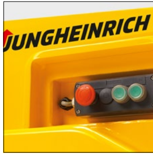
Inching buttons for simple coupling and decoupling