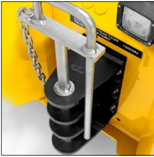
Different couplings available (optional)