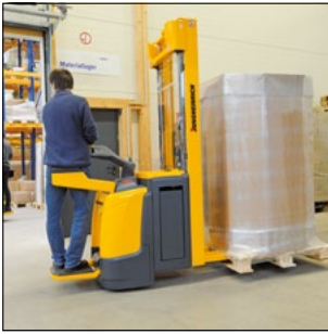
ERC 216z - pallet sideways entry