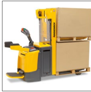
Double-decker mode (optional)