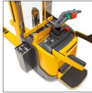
Sideways battery removal